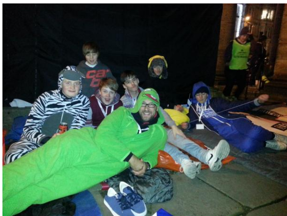
Company Section of 1 st Kirkliston Boys’ Brigade sleeping out in George Street