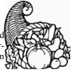
Harvest 'Horn of Plenty'

Just before we went on holiday, one or two of us conducted a 'prayer walk' around our village. This was such an interesting experience, enabling us to truly focus our prayers on things that matter to us- and to God.